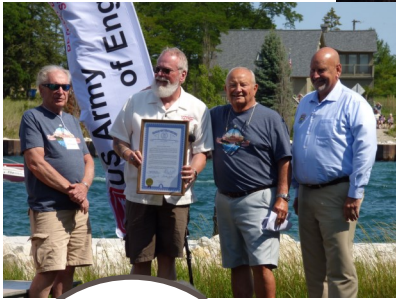
Portage Lake 150 year celebration and channel dedication